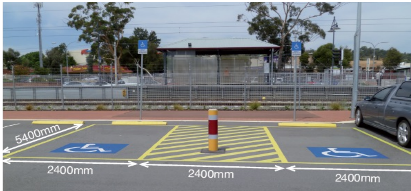
ACROD parking bays with shared space, ground markings and bollard